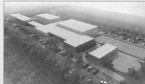
Plans for the pavilion in CTPark Brno South location. Including athletics facilities, supermarket and a day care centre.

Several of the warehouses in the park will have direct rail